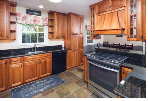
604 Ivydale Road, Wilmington, DE 19803 / 3 Bedroom • 2.5 Bath • 1,725 Sq./Ft